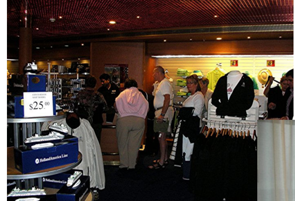
pack many tee shirts for the cruise in anticipation of such acquisitions.

posted on the Signature Shop window indicating that the shop was closed until September 23. Well, September 23 finally rolled around and the doors swung open. No Alaska tee shirts on sale but an Asia & Australia tee was quickly purchased and swept into a bag. We purposely didn't